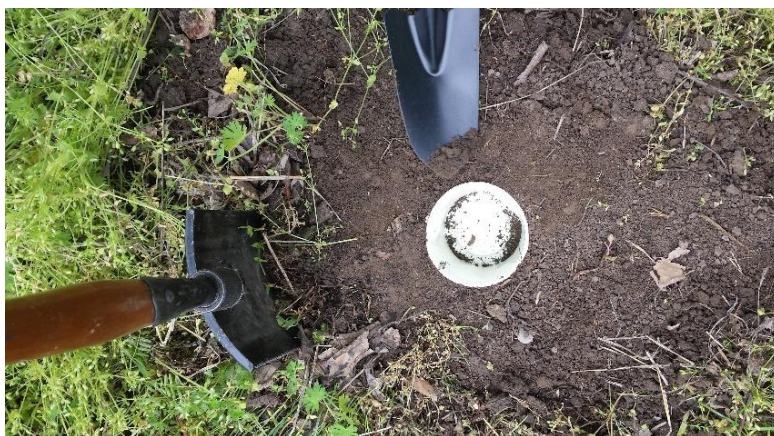
Fig. 1. Installation of traps in the experimental plots

Between six and twelve traps were installed in each ecosystem, in accordance with the recommendations of Talmaciu [2019], who demonstrated that at least five traps are sufficient for capturing dominant and rare species, while installing more than twelve may significantly alter abundance ratios.